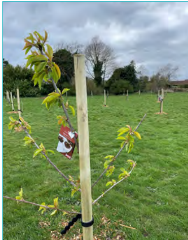
Fruit trees at the orchard.

The fruit will be available to anyone so we hope the area will be respected as a community asset.