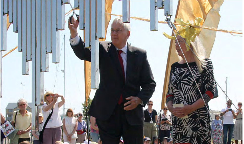
The Duke of Gloucester officially opened the Bord Waalk sculpture trail.

It's all about working with and joining up the different organisations to create scaled opportunities rather than disparate groups competing!