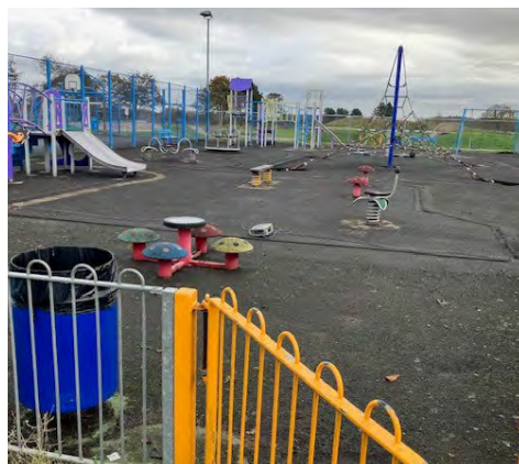
The playground surface has been replaced.

Our affordable housing is fully rented and yet another of our tenants has been able to step onto the home ownership ladder.