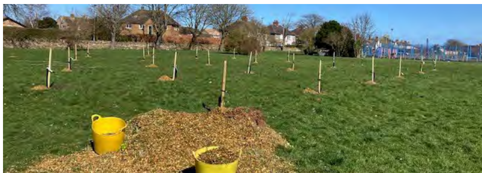
Planting the orchard.

The profit and loss account has been prepared on the basis that all operations are continuing operations.