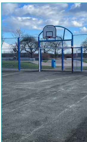
The MUGA at the Welfare

the current plans include passage across the welfare from the old site which will still be used as a car park and drop off point to the new site, we welcome contact to discuss how this will work and to see if we can negotiate use of the car park for our football teams at weekends and evenings for matches and training. This will be beneficial to the teams and residents of nearby streets where parking is proving an issue.